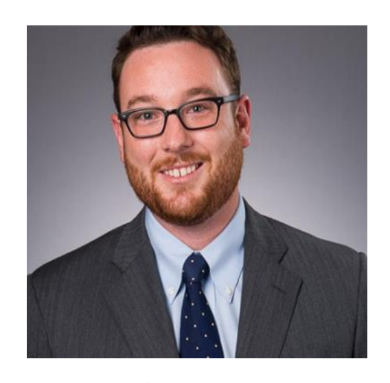
Tripp May Telecom Law Firm